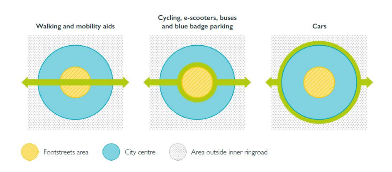
Figure 1 – City Centre Access model

32. Having considered all of the above feedback an overarching guiding principle has developed to create a City Centre Access model on which the recommendations in the review are based. This centres on three key principles – that the footstreets is an area where people walk or use their mobility aids; that cyclist, e-scooters, buses and blue badge holders are encouraged to be within the city centre but to pass around or park on the edge of the footstreet area; and where people choose to use cars and vehicles rather than public transport they are encouraged to use, and park outside of, the inner ring road.